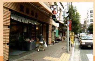
Azabu Juban Shopping Town